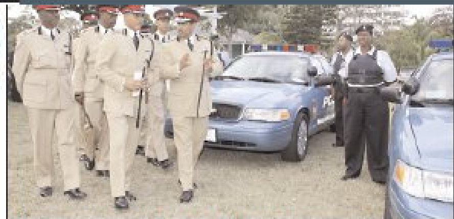
COMMISSIONER OF POLICE ELLISON GREENSLADE and Deputy Commissioner Marvin Dames discuss the increased benefits of the new police vehicles.