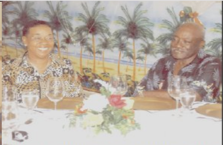
RETIRED police officers share laughs at a recent luncheon hosted by the Retired Police Officers Association.