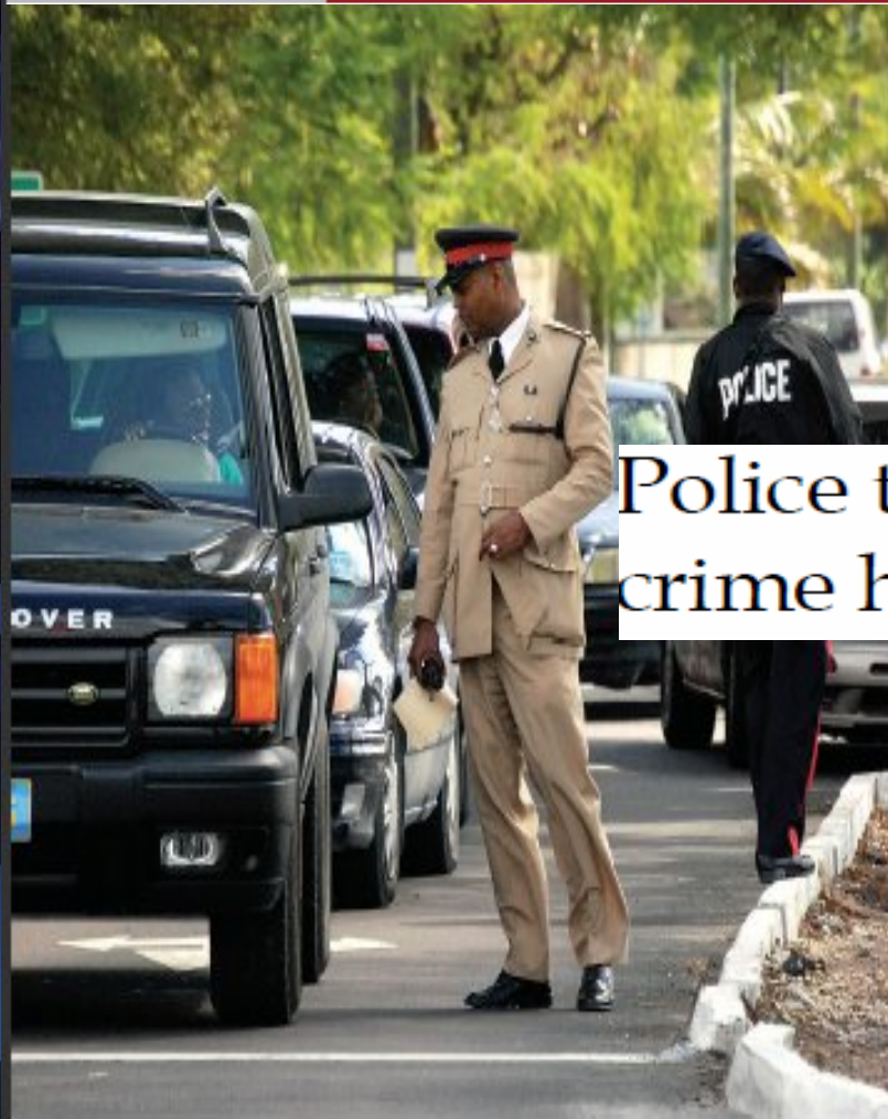
■ Police set up a road block at the intersection of Joe Farrington Road and Fox Hill Road Wednesday morning, part of three separate operations conducted yesterday.