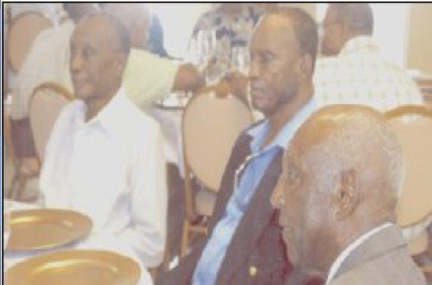
RETIRED POLICE officers at the luncheon.